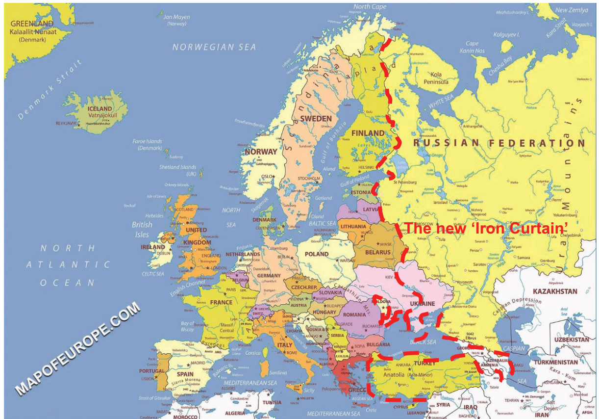
Figure 2. A probable new “Iron Curtain” near the European Security Corridor

in Figure 2. On one side will be the US-West block, including new allies such as Finland and, in the near future, Sweden or countries with a European perspective (like the South Caucasus ones). On the other side will be the BRICS block countries, including here the ones that remain within Russia's sphere of influence (Belarus and Republic of Moldova). Türkiye will be in a difficult position if Ankara considers itself as more of an Asian country. In this scenario, Ukraine will lose its eastern and south-eastern territories and will become like the divided Germany of the 1960s–1980s, having the Dnipro River as its border. The status of Armenia remains unclear.